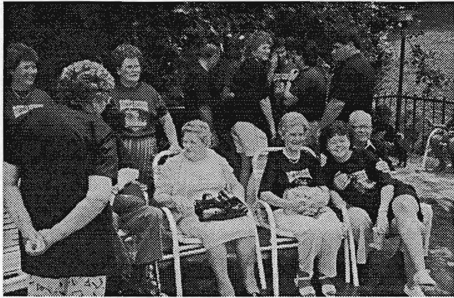
Family members relaxing at the poolside.